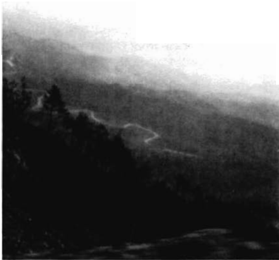
BILL TROY'S PHOTOS OF THE PUNCH BOWL PASS,