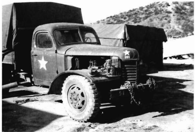
PHOTO OF A LARGE RUSSIAN TRUCK.