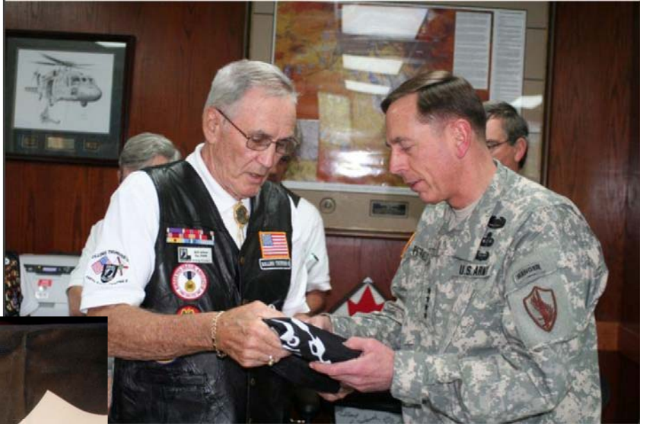
Left: Photo of POW/MIA flag donated to the Florida 24th IDA Group.

And, Bill’s name still keeps popping up unexpectedly , most recently at our Chapter 169 Korean War and Korean Veterans Asso-