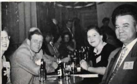
JOHN JUSTICE GROUP