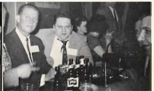
LAFAYETTE POST GROUP