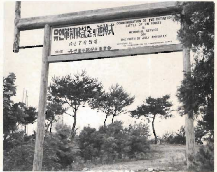
Archway leading to the monument. Must be rebuilt.

Eighth Army then goes on to advise that it would "appreciate any available historical information about Task Force Smith, its composition and its operations in Korea". Unbelievable? We're not kidding.