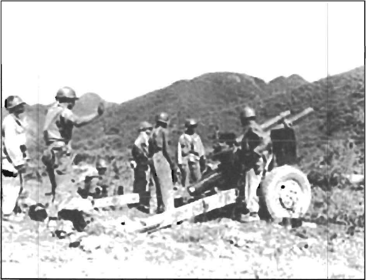
Truck-drawn, 105mm howitzer of the type used by the 63d Field Artillery Battalion in Korea.