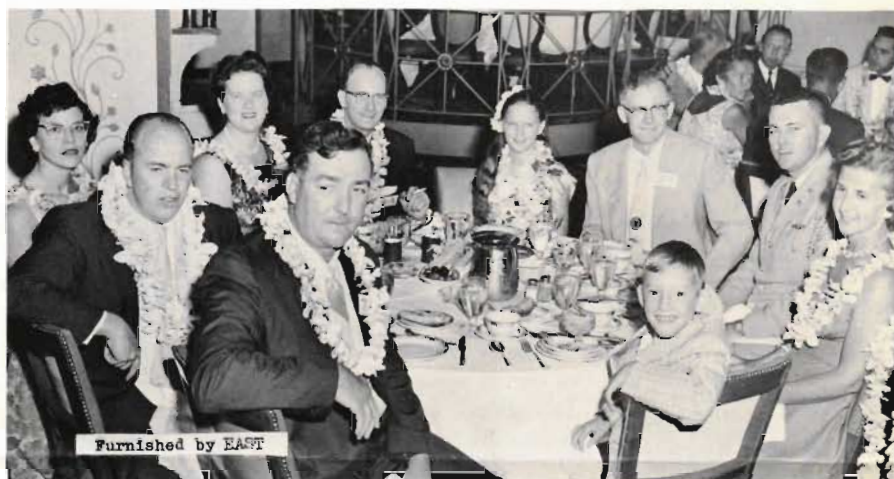
Furnished by EAST