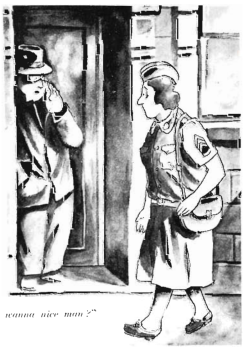
"Pssst ... G.I., you wanna nice man?"